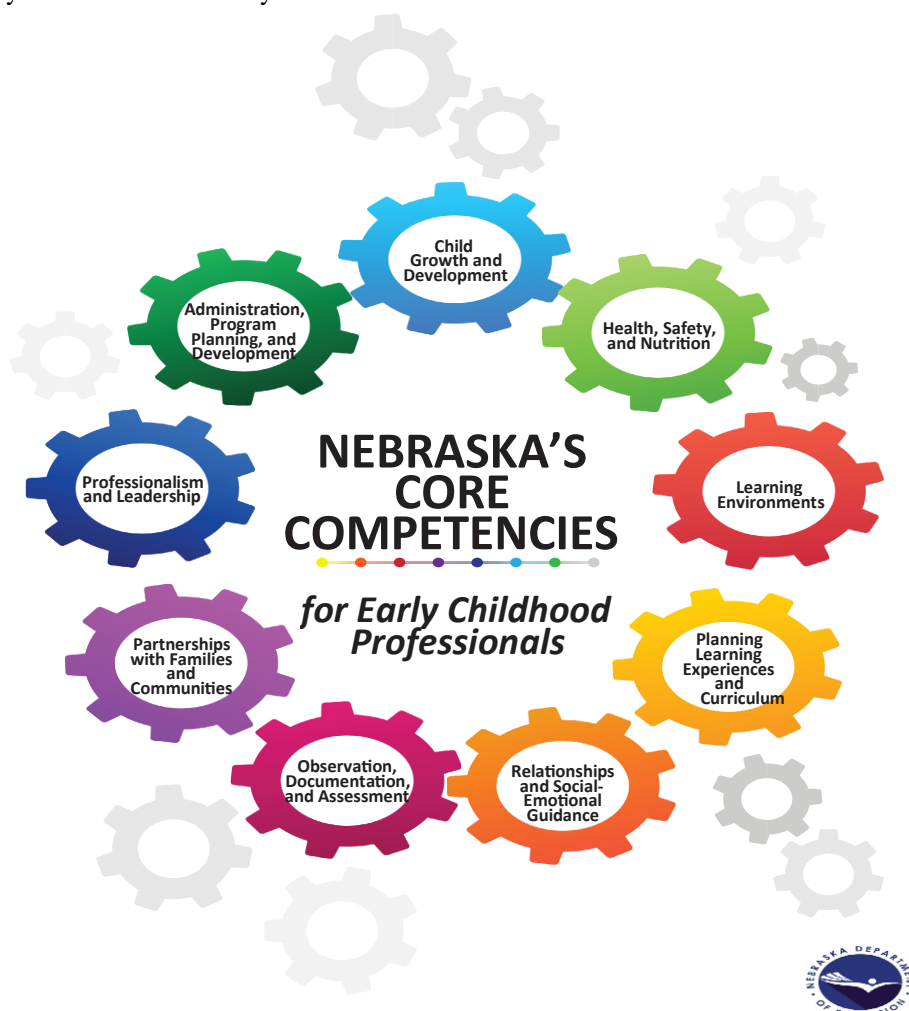
Figure 1. Nebraska Core Competency Structure

(8) Professional and leadership development: Professionally serving children and families and participating in the community as an advocate for early childhood education and care.